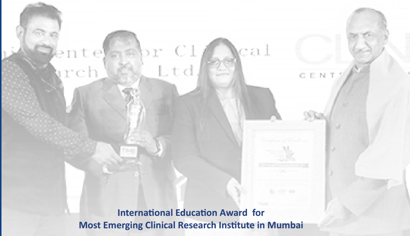
International Education Award for Most Emerging Clinical Research Institute in Mumbai

BE A PART OF AWARD WINNING CLINICAL RESEARCH INSTITUTE