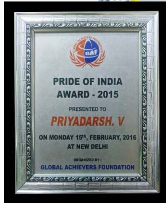
Pride of India Award