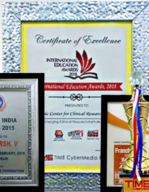
Top 100 Franchise Opportunities for the